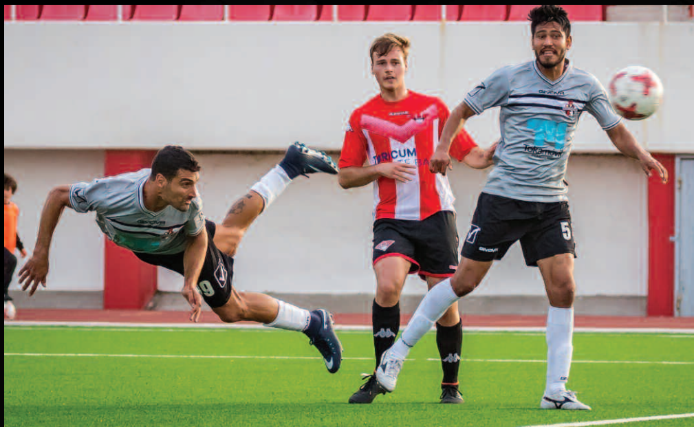
MONS Calpe comfortably saw off Gibraltar United in the first of this season's Gibtelecom Rock Cup semi-finals.