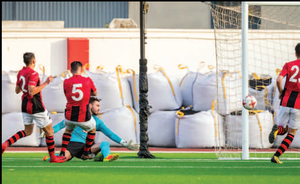
EUROPA FC marched into the Gibtelecom Rock Cup Final by seeing off a spirited Lincoln Red Imps by three goals to one.