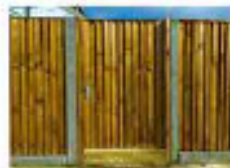
Close Board Gate With Concrete Posts