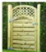
KDM Arched Lattice Gate