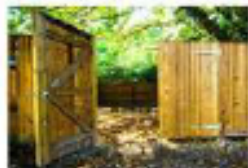
Close Board Gates