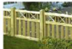
KDM Elite Cross Top Gate