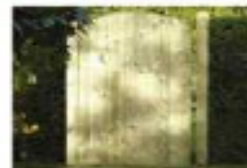
KDM Tongue and Groove Gate

Please call for more information of all sizes available or Click Here for PDF Price List Page.