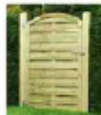
KDM Arched Horizontal Gate