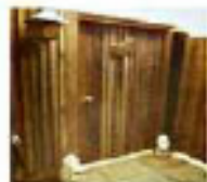
Close Board Gate

All our Gates are of strong construction made from seasoned timber and treated to last. Metal Gates Galvanised and painted to your colour. Concrete posts & Gravel Boards are reinforced metal inside. But all our fences can be constructed and made to your sizes, colours or requirements.