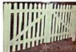
Palisade Gates Painted White