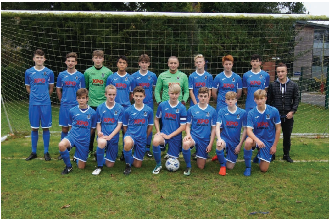
Under 18's Team