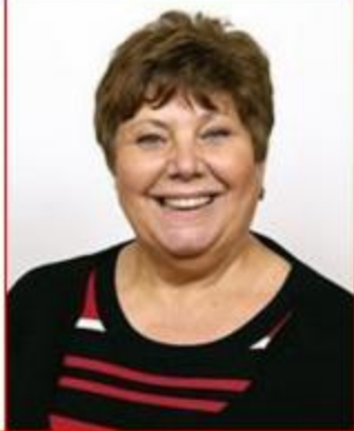
Marie Rimmer MP