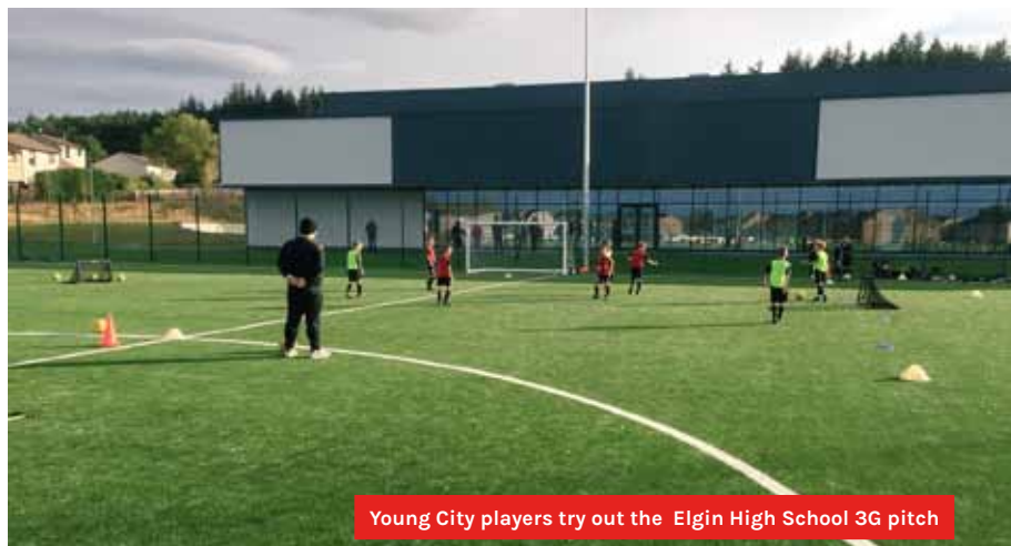
Young City players try out the Elgin High School 3G pitch

Keep up to date with the academy on @ECFCacademy (Twitter)